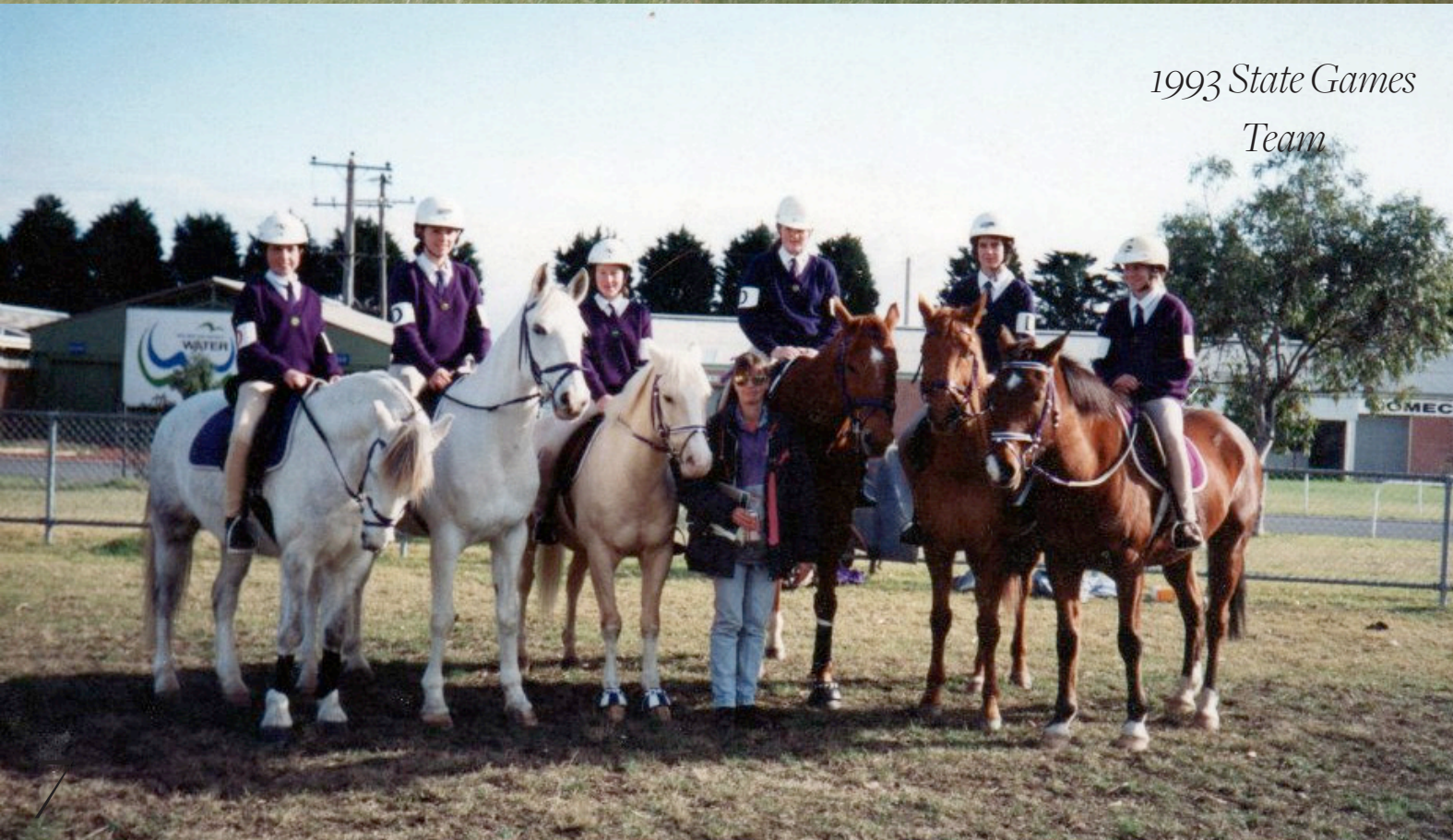
1993 State Games Team