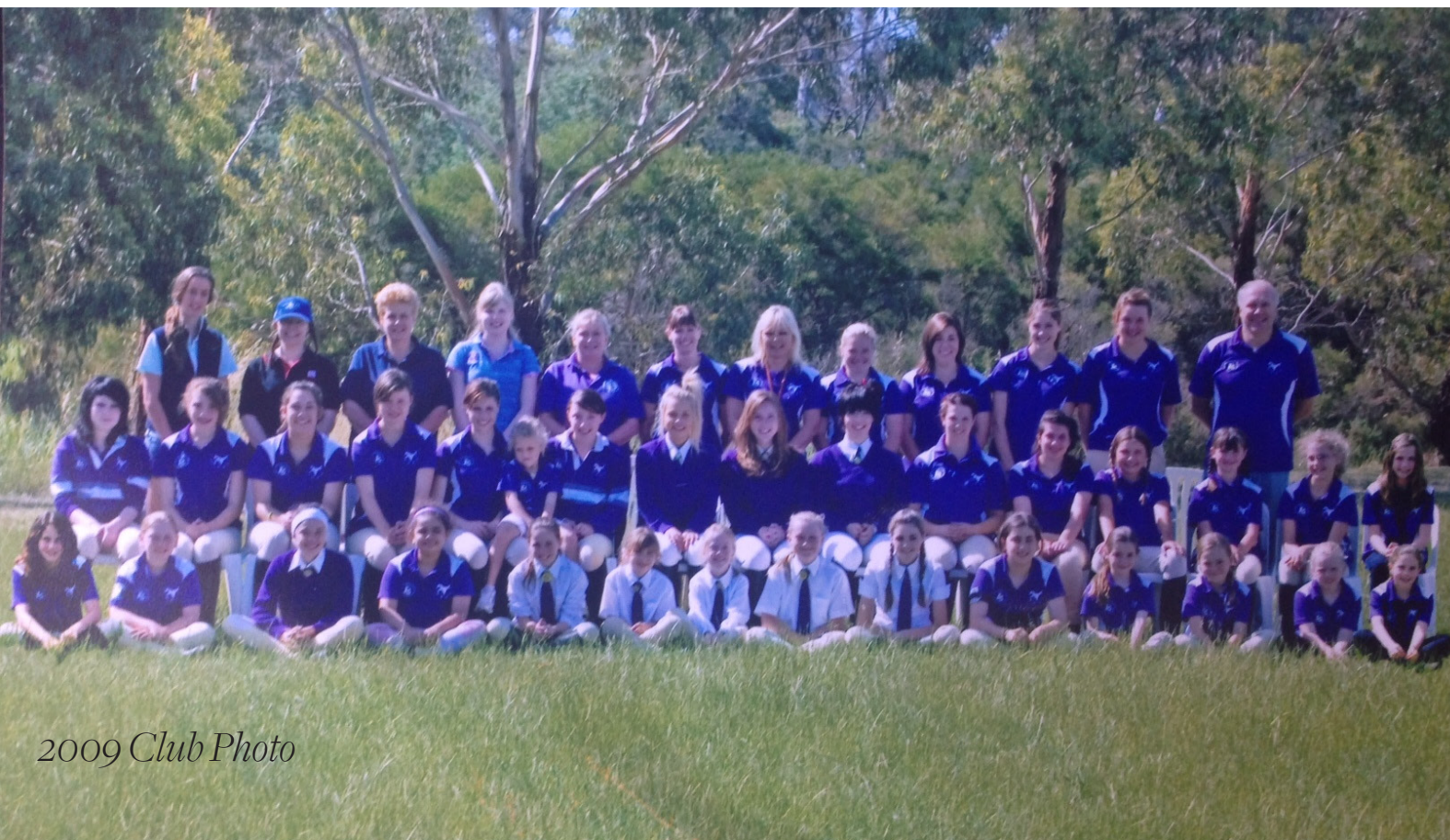
2009 Club Photo