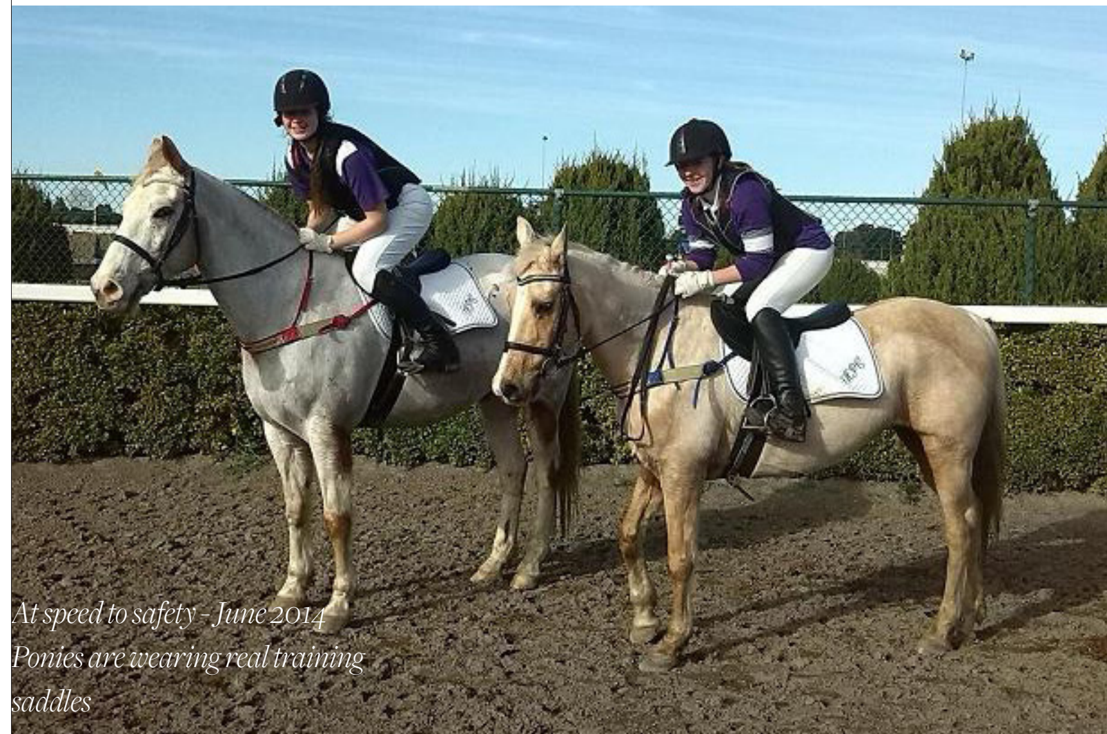
At speed to safety - June 2014 Ponies are wearing real training saddles

PLEASE SEND ALL COMPETITION RESULTS AND PHOTOS TO RALLYROUND@ EMAIL.COM