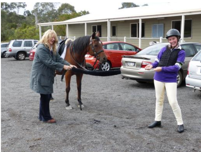
What is the horse thinking????