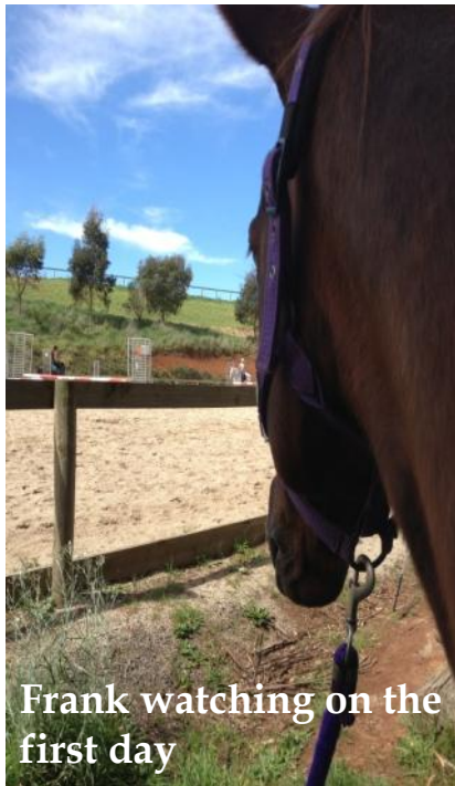
Frank watching on the first day