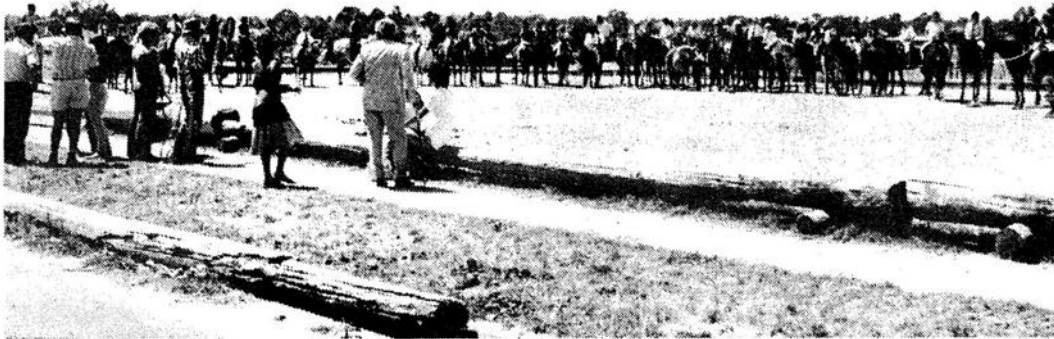
IN its heyday, the Nunawading Pony Club had some 185 members.