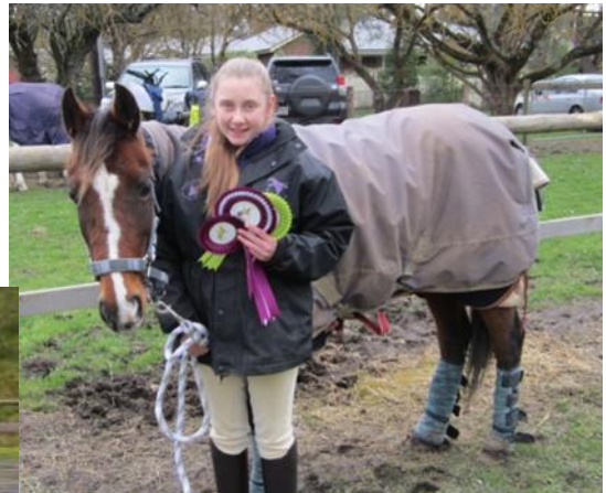
Kirra at Seville Dressage Day Overall 5 th with a 4 th and a 5 th . Not bad in spite of having the Flu!