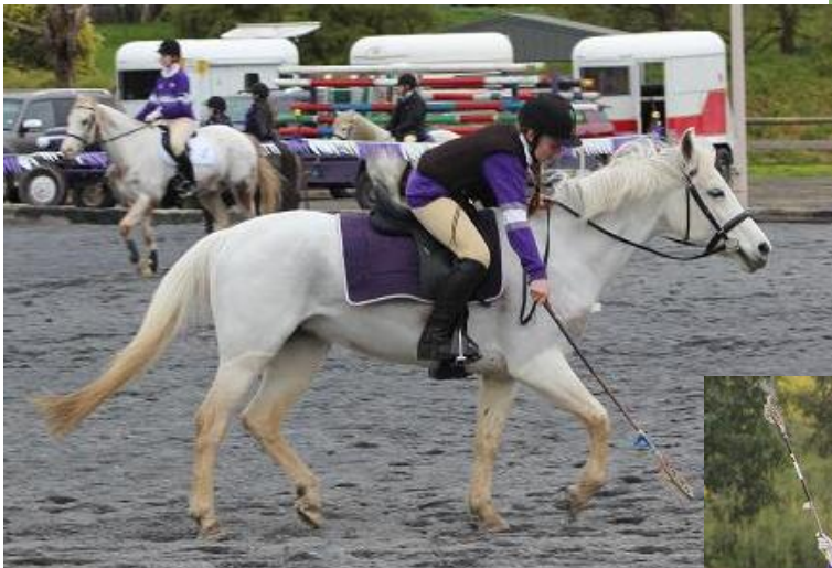
Learning Polo cross at our last rally.