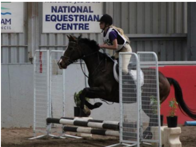
Jade & Star at Werribee