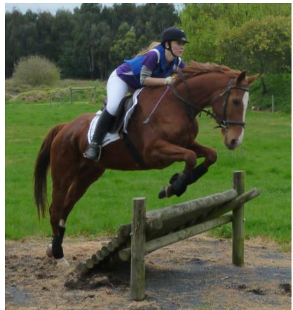
Scarlett & Saffy