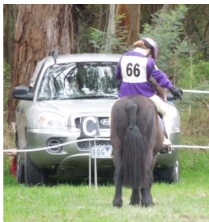
Donvale Dressage Day....halt, salute