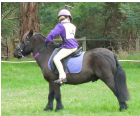
The Pee! - Go Rocky...