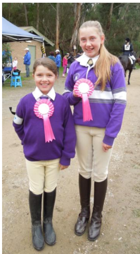
Donvale – Kirra 5th in 5 B