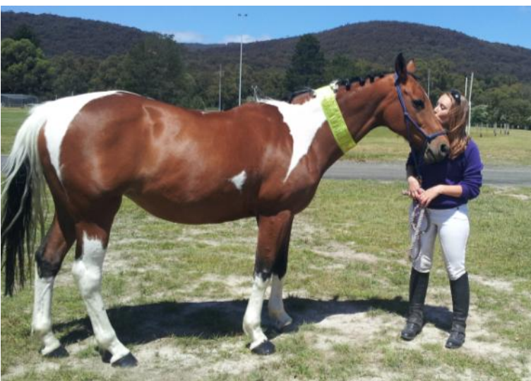
State Qualifiers at Wesburn.

Malibu Stacey – 4th overall (out of 31 combinations).