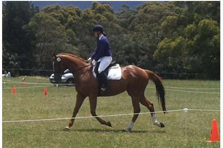
Scarlett on Saffy