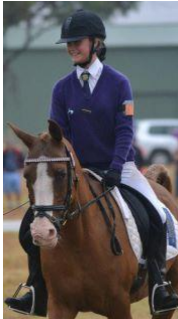
1st—State Dressage Grade 3

Nunawading and District Horse and Pony club Inc. — A0003234C