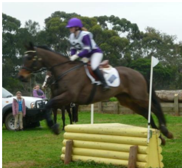
Scarlett & Elmo

Start planning your Christmas costume now as there is a great event at the Christmas Rally.