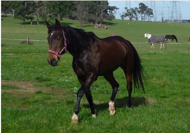
Kalinda June 20th 2011