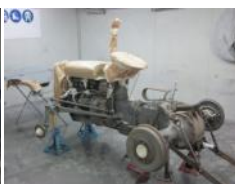
strip & repair