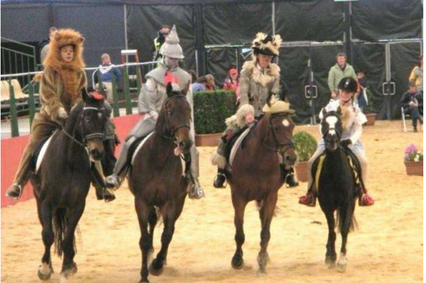
Musical Ride Team performing at Equitana

Nunawading and District Horse and Pony Club Inc. A0003234C